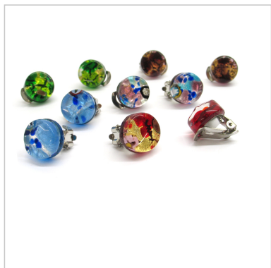
Cod. OREC01 CLIP